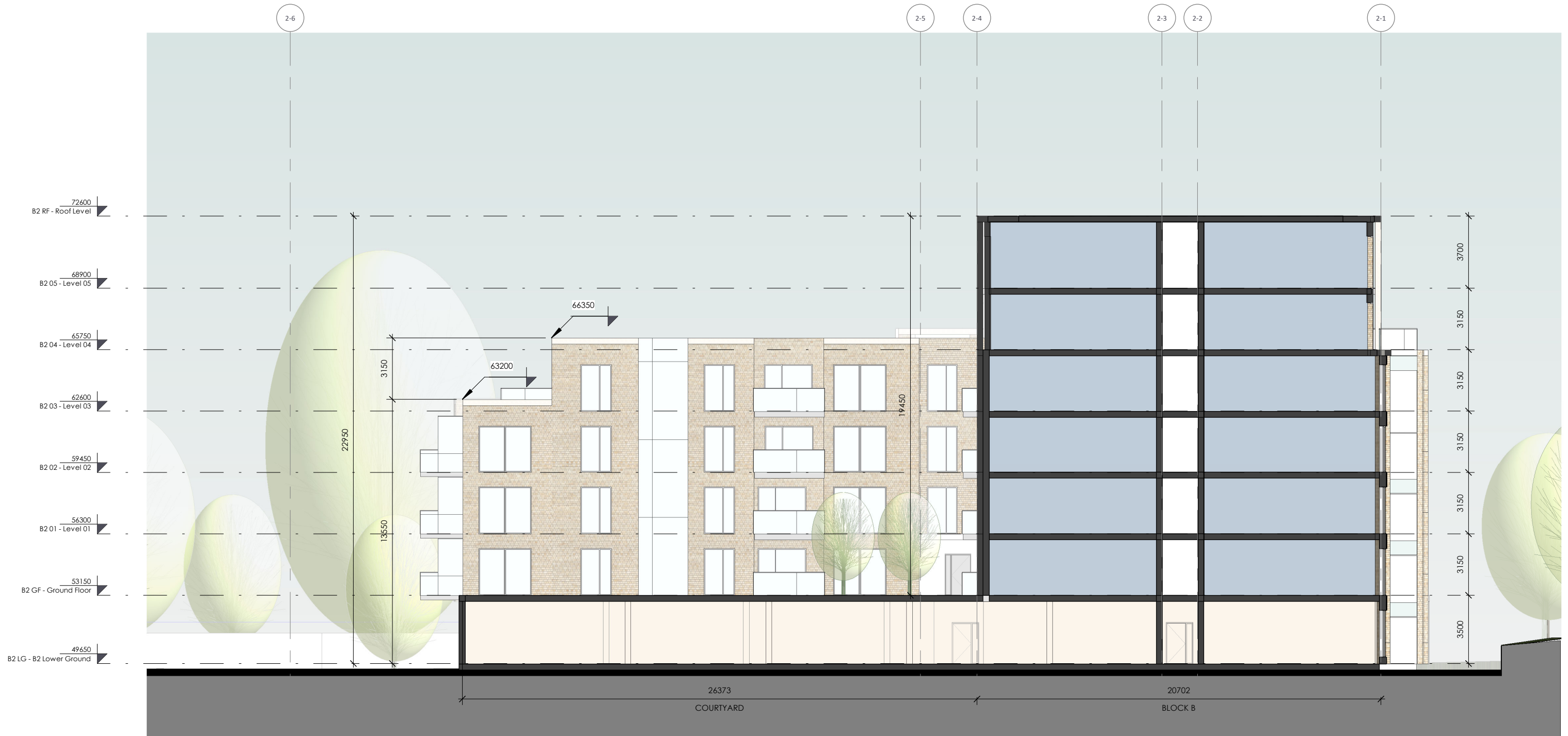
1 Blocks B-C Section 3 1 : 200