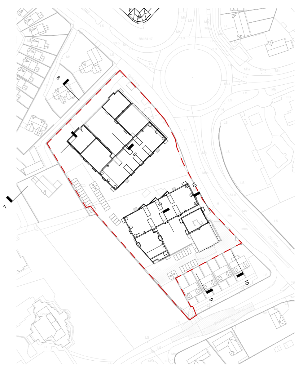
5 Key Plan 02 1:2000