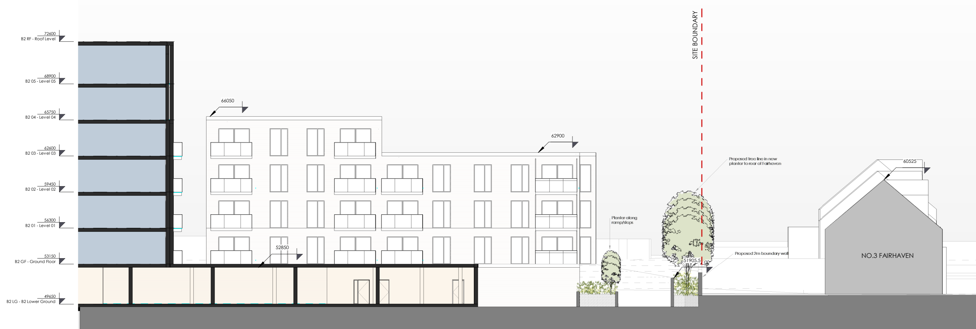
3 Section 9 1:200