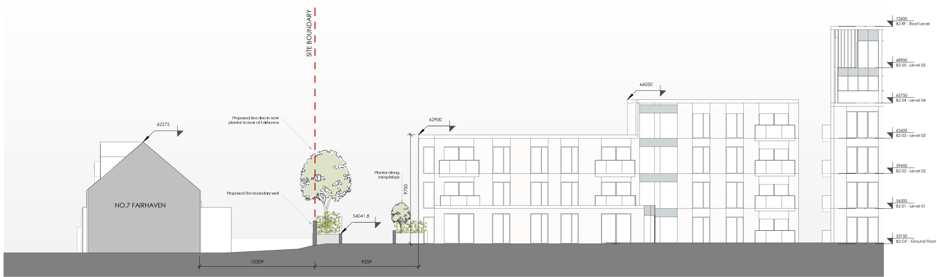
4 Section 10 1:200